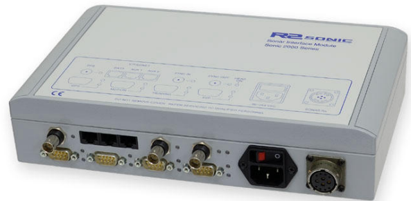
Sonar Interface Module